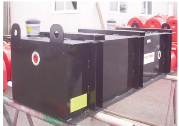
Compatible with a wide range of fuels and chemicals, including conventional diesel and biodiesel